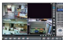
GKB Envoy™ Software NVR10